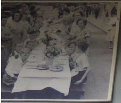
The Queen's Coronation, 1953