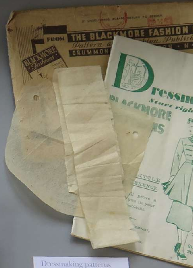
Dressmaking patterns 1950s