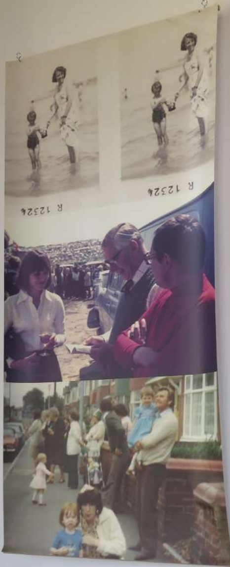
'That was our playground, the bomb sites'